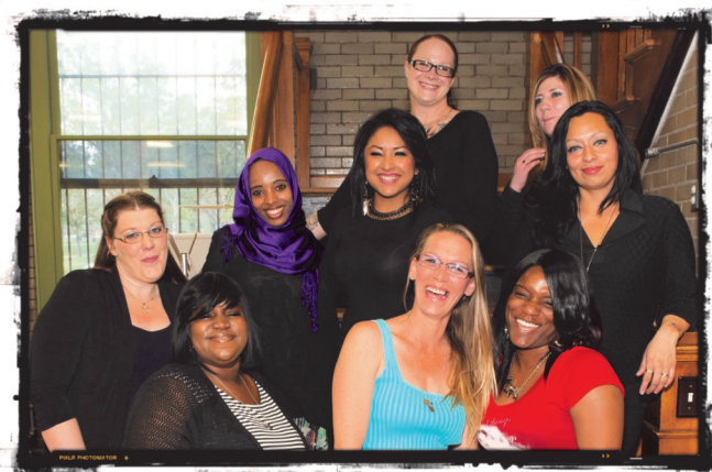
Pictured above: 2014-15 program graduates. Not all women pictured.

We hire women who come from all walks of life and different backgrounds who are struggling to get or keep a job. These women develop hands-on job training by working in our food manufacturing and jewelry businesses. In conjunction, the women attend program activities that are designed to help them develop life skills for long-term success. Our goal is to empower each individual woman to change her life and to create a better future for herself, her family, our community and our economy.