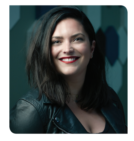
Q: Why did you choose WBP?

A: I had been looking for an organization to become more hands on with and hadn't found the right fit. With WBP I love the guiding principles of providing women the opportunity to help themselves and make long term changes that will dramatically change the course of their lives for the better. It was clear to see from my first interaction that the methods here work and I was excited that there were multiple ways to get involved.