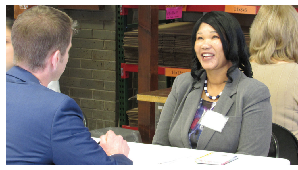
Engaging photo caption with short description