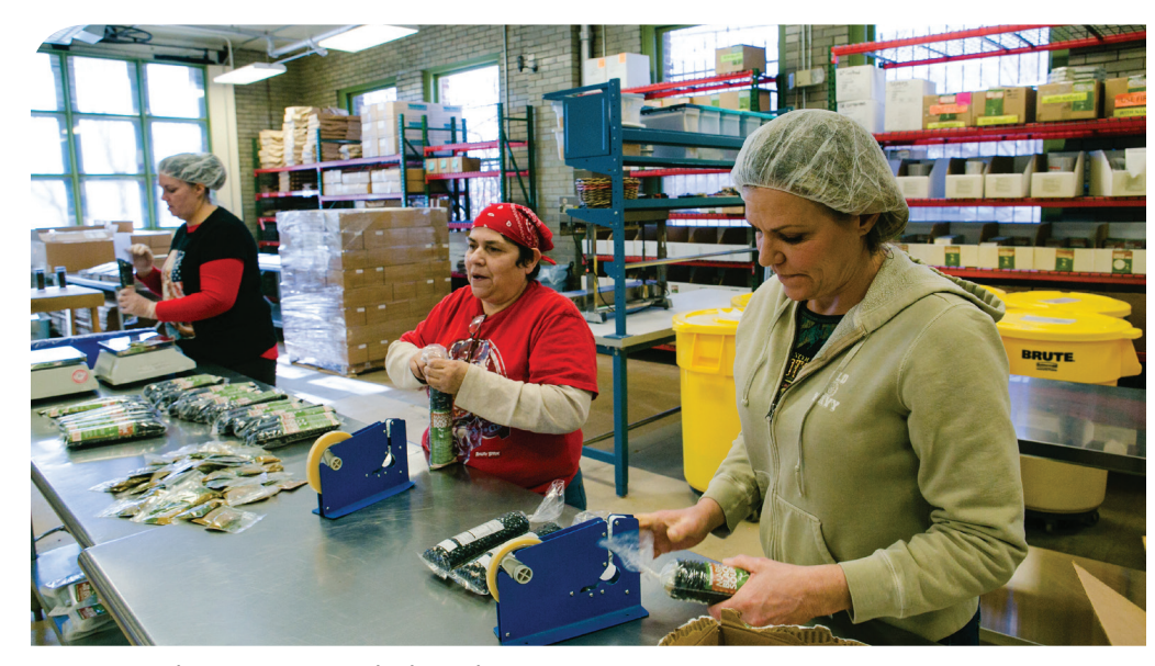
Engaging photo caption with short description