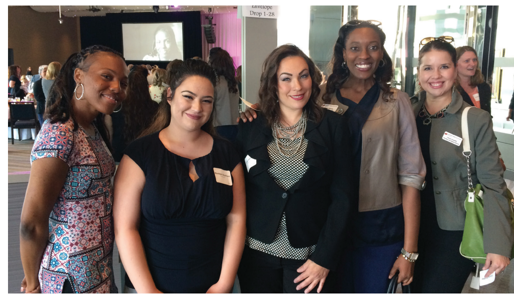
Engaging photo caption with short description